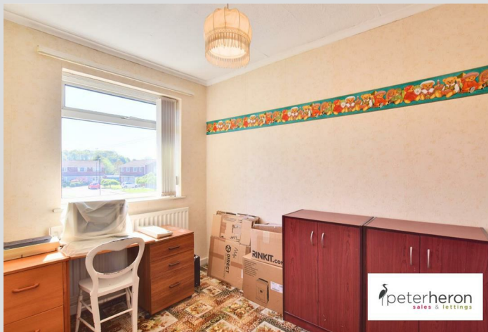
Bedroom 3 9'4" x 6'10"

Double glazed window to rear elevation and radiator.