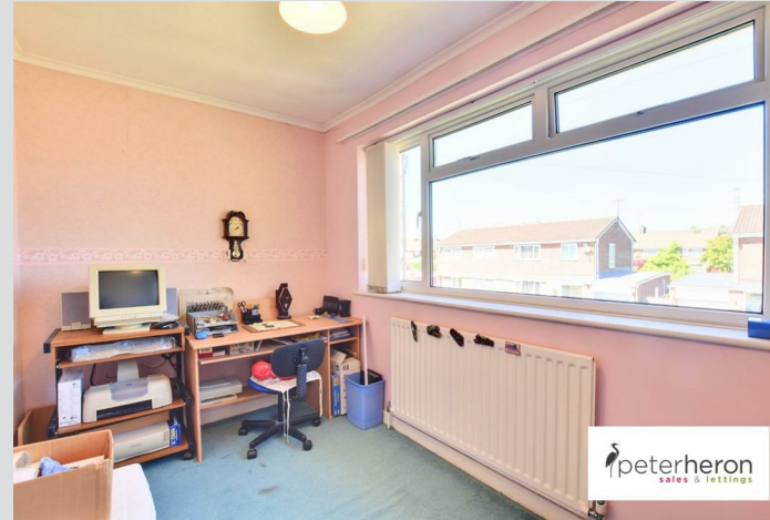
Bedroom 4 6'7" x 10'10"

Double glazed window to front elevation and radiator.