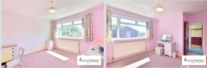
Bedroom 2 14'1" x 11'3"

Double glazed window to rear elevation, radiator and storage cupboard.